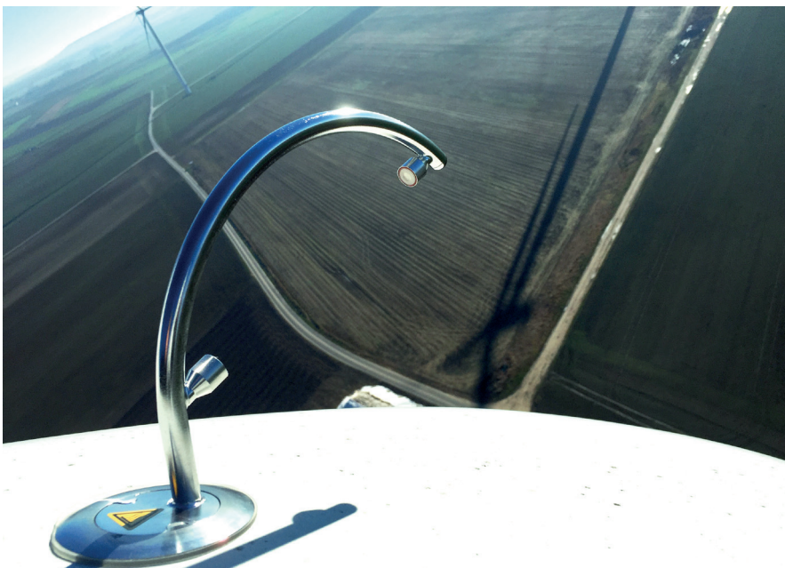
View of iSpin mounted at the rotor of a wind turbine

HH: Wind turbines are energy producing devices, meaning it is important for the customer and the OEM to know how efficient a turbine converts energy from the given wind conditions.